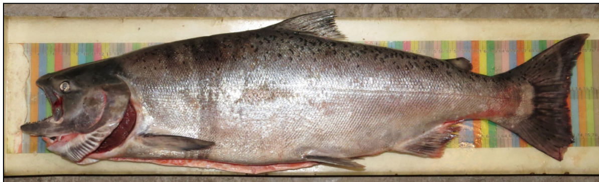
fig. 1. Oncorhynchus tshawytscha , río Paraná, San Pedro, Buenos Aires. Total length: 732 mm