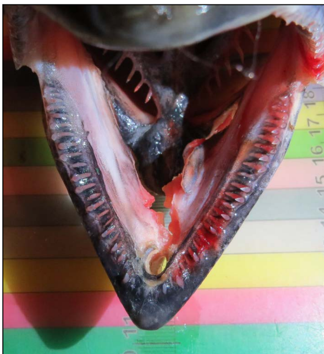
fig. 3. Lower jaw, showing teeth and typical gum dark coloration.