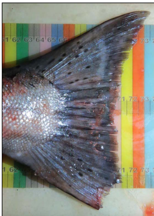
fig. 2. Caudal showing black spots in both lobes.

Although the fish had been eviscerated, it was very probably a female because of the “remarkable strong reddish gonad” observed by the fisherman.