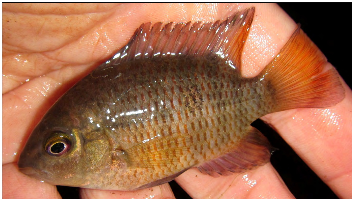
fig. 1. Australoheros guarani , subadult, live specimen immediately after capture (not preserved)