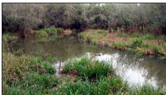
fig. 8. Lagoon by Río Tembey tributary at RN6, Río Paraná drainage, Paraguay, 4. 9. 2016, 17:20, 26°20'52.22"S - 55°13'47.69"W, 255 m. Australoheros guarani (7 specimens) was caught in this side lagoon and it was very easily collected by a cast net.