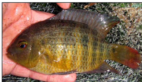
fig. 3. Australoheros guarani , adult (same specimen as fig. 2).