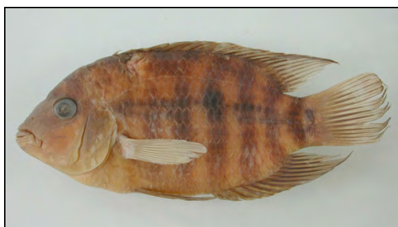
fig. 4. Australoheros guarani , holotype, adult, MHNG 2237.58, Río Guyraugua, Río Paraná drainage, Paraguay.