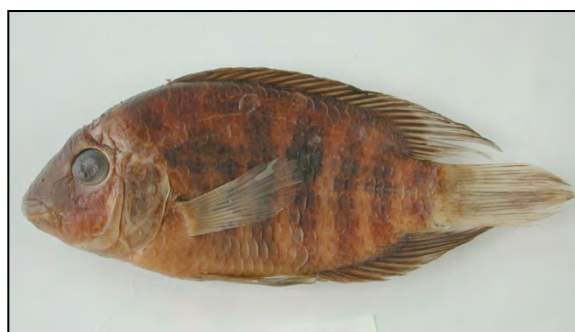
fig. 5. Australoheros guarani , paratype, adult, NRM 33498, Río Tembey 4 km below the falls, Río Paraná drainage, Paraguay.

The lagoon where the here reported specimens of A. guarani were collected (4. 9. 2016; Fig. 8) was about 40m long and 6-10m wide (verified also from Google Earth satellite image dated closest to the date of collection on 19.05.2016) with a depth where the A. guarani specimens were collected of about 1m. Seven specimens were collected with a cast-net very easily within five minutes during not very favorable conditions just fifteen minutes before sunset after several days with some rain. Australoheros guarani was thus common in this lagoon at the time of collection which supports it as a favorable and possibly representative habitat for the species.