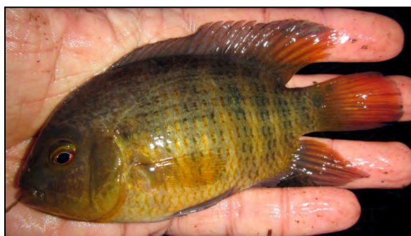
fig. 2. Australoheros guarani , adult, live specimen immediately after capture (not preserved)