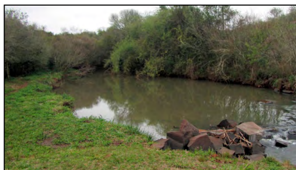
fig. 7. Río Tembey tributary at RN6, Río Paraná drainage, Paraguay, 04.09.2016, 17:20, 26°20'53.28"S - 55°13'46.30"W, 255 m. Australoheros guarani was again as in 2009 (fig. 6) not caught in the main stream shown in the photo (neither with cast net nor with three 20m gillnets) but in a side lagoon (fig. 8) connected by a very small channel (fig. 9) following the path at the left hand side of this photo.