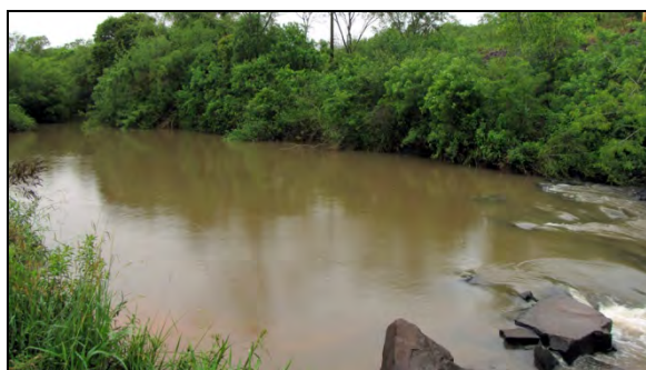
fig. 6. Río Tembey tributary at RN6, Río Paraná drainage, Paraguay, 14.11.2009, 14:55, 26°20'53.28"S - 55°13'46.30"W, 255 m. Australoheros guarani was not caught at this time neither with cast net nor with three 20m gillnets. The locality was collected in suboptimal conditions after several days of heavy rain (see high water level and turbid water).