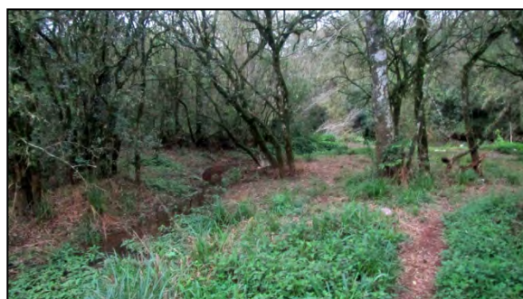
fig. 9. Small overflow stream connecting Río Tembey at RN6 (fig. 7) with the lagoon (fig. 8) where A. guarani was collected, Río Paraná drainage, Paraguay, 04.09.2016, 17:20, 26°20'52.55"S - 55°13'46.38"W, 255 m asl.