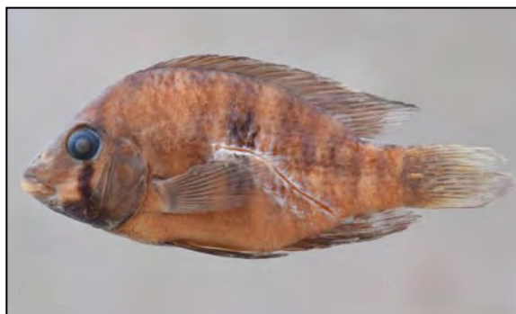
fig. 4. ZFMK 39780. preserved specimen