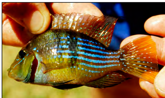
fig. 1. Gymnogeophagus terrapurpura . ZFMK 39780. alive, upon capture

Gymnogeophagus terrapurpura : all lots from Argentina, Entre Ríos province, Colón county, Uruguay river basin: MACN-ict 12248, 75-77 mm SL. Arroyo de la Leche at RN 135, near the city of Colón, 32°14'42"S 58°8'58"W, coll. H.G. Fernández, 28.01.2016. MLP 11227, 62 mm SL. Municipio Villa Elisa, balneario municipal, Arroyo Perucho Verna, 32°10'27"S 58°18'33"W, coll. A. Puentes, 09.2016. ZFMK 39780, 7.5 mm SL. Municipio Ubajay, estancia Los Monigotes, Arroyo San Benito, 31°49'64"S 58°10'74"W, coll. S. Koerber, R. Filiberto, J.O. Fernández Santos, 02.02.2002.