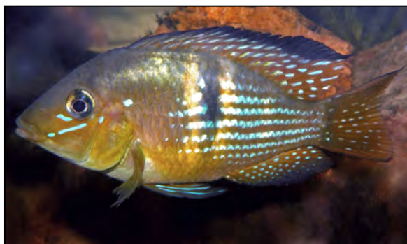
fig. 3. Gymnogeophagus terrapurpure . MACN-ict 12248. alive, in aquarium