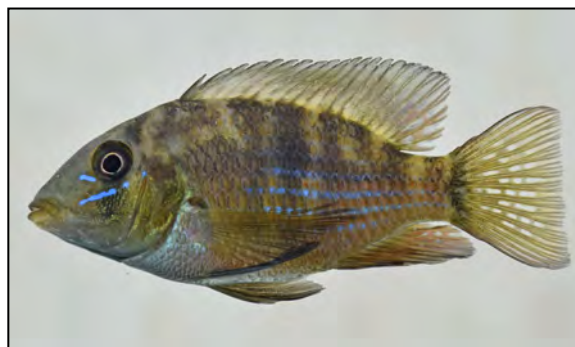
fig. 2. Gymnogeophagus terrapurpura . MLP 11227. juvenile, alive, in aquarium