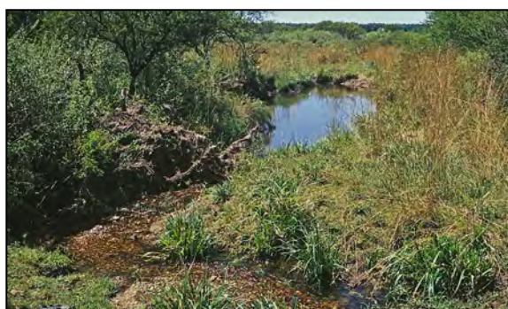
fig. 6. collection locality of ZFMK 39780