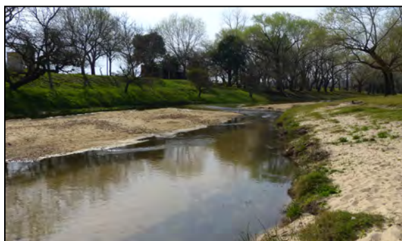
fig. 7. collection locality of MLP 11227.