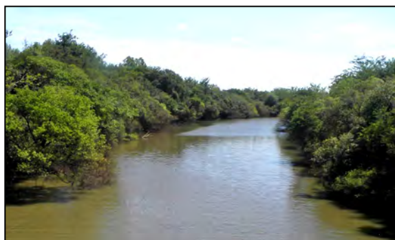
fig. 8. collection locality of MACN-ict 12248