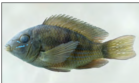
fig. 5. MLP 11227. preserved specimen