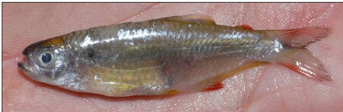
fig. 2. Diapoma pyrrhopteryx , upon capture, MLP 10915, male, arroyo Toro

The identification of D. pyrrhopteryx was made based on the original description published by Menezes & Weitzman (2011).