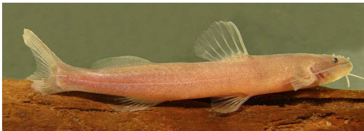
Fig. 1. Lateral view of Phenacorhamdia tenebrosa , in life.

During field trips in the Paraná river basin, Argentina, four specimens of P. tenebrosa were found in the lower Paraná river basin at Yaciretá dam near Ituzaingó city, and one in the arroyo La Azotea at Pre-Delta National Park. The aim of this paper is to register for the first time the finding of this species in freshwaters of Argentina.