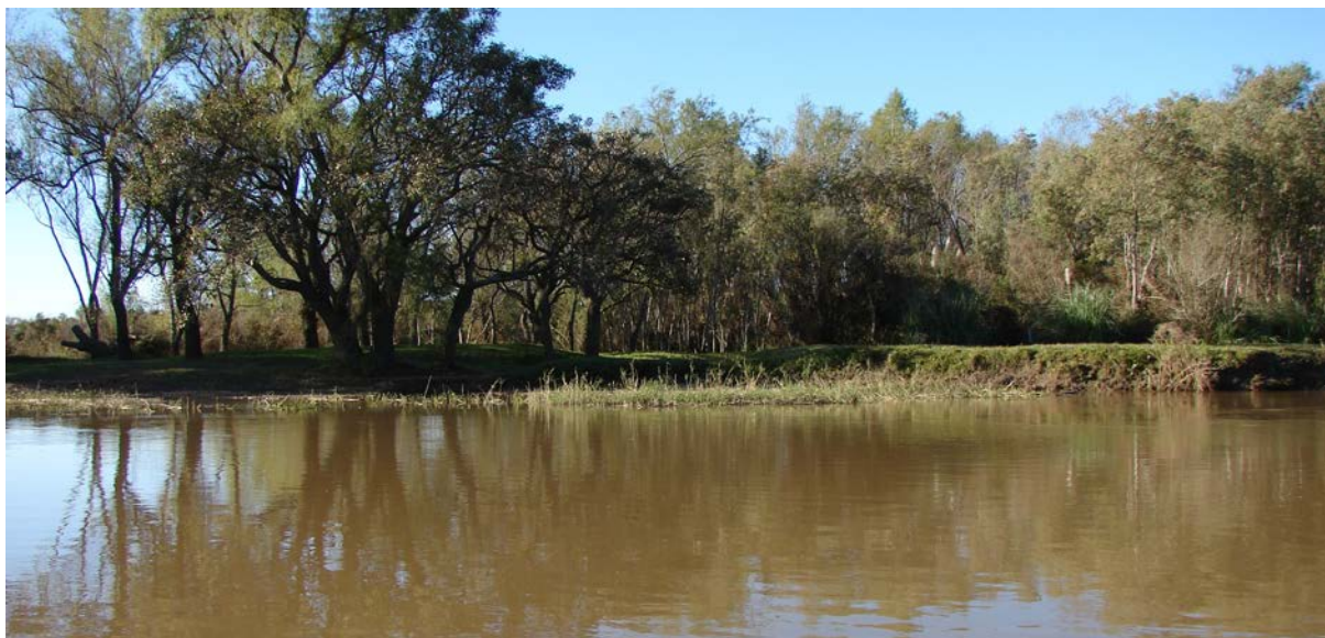
Fig. 2. Arroyo La Azotea, Tapera de Chano in Pre-Delta National Park, the southernmost locality where Phenacorhamdia tenebrosa was collected.