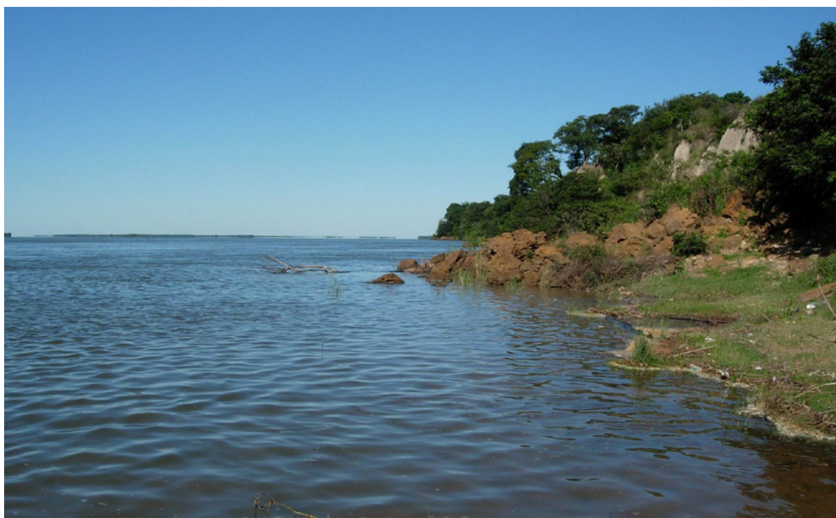
Fig. 2. Río Paraná at Yahapé, where Pimelodella taenioptera was collected.

Ground colour silvery grey (Fig. 1). Head and flanks and caudal fin with a dark stripe. Middorsal body with a black stripe from the rear part of head to the end of adipose fin. Dorsal and pectoral fin smoky.