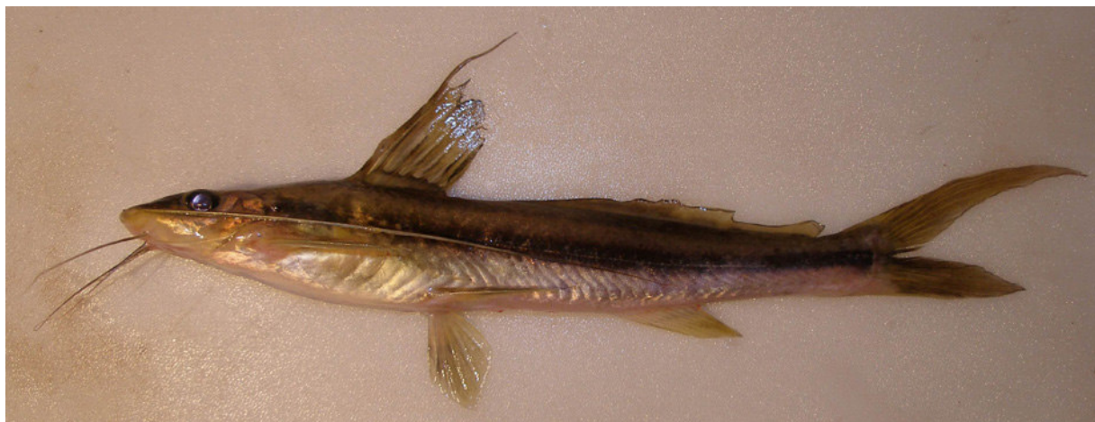
Fig.1. Lateral view of Pimelodella taenioptera upon capture.

Gonzalez et al., November, 2007. AI 245 1 ex., 177.5 mm SL, Argentina, Corrientes province, río Paraná at Itá-Ibaté (27°25'49.7"S - 57°21'59.9"W). coll: A. Gonzalez et al., February, 2007.