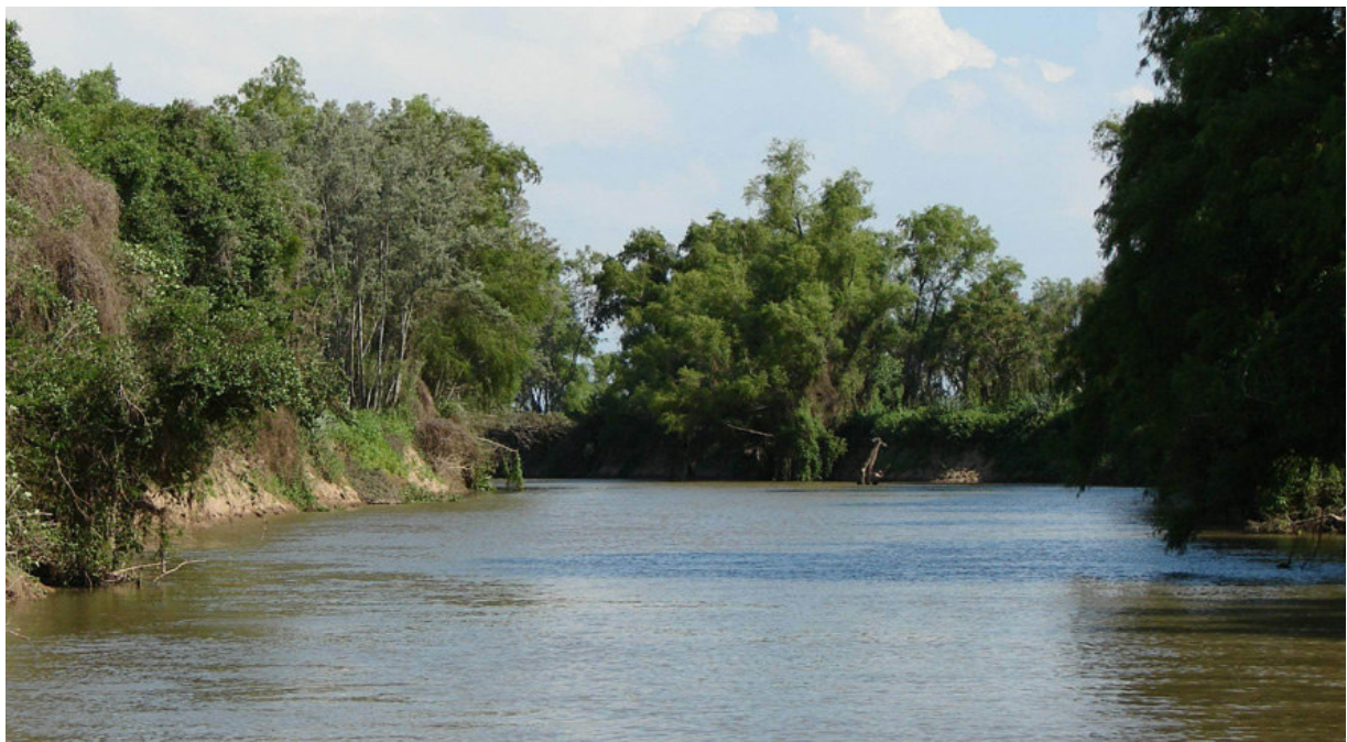
Fig. 2. Arroyo La Azotea in Pre-Delta National Park, where Pterobunocephalus depressus was collected.