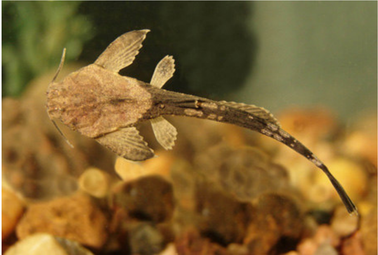
Fig.1. Dorsal view of an alive specimen of Pterobunocephalus depressus .